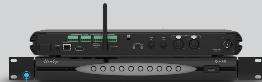
Shown with included rack ears.