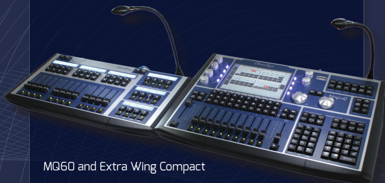
MQ60 and Extra Wing Compact

0300-0047 Padded Bag for MagicQ PC Wing Compact/Extra Wing Compact